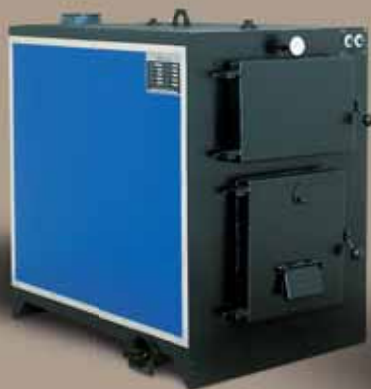
Linka 70-93 series