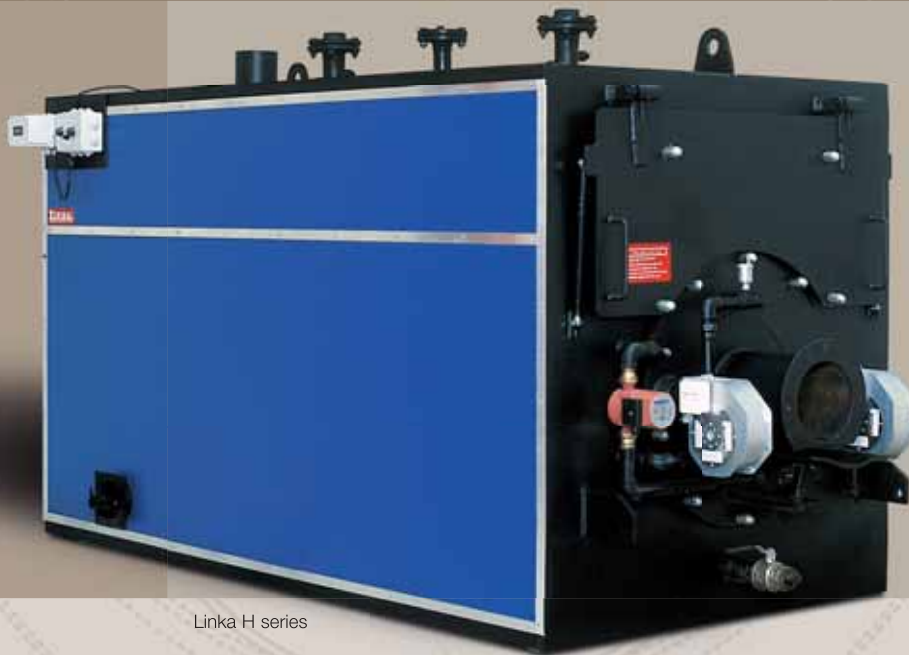
Linka H series