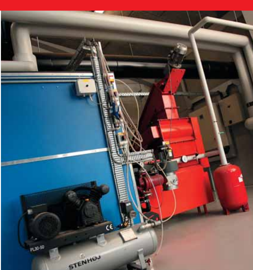
Wood chip heating plant

The average consumption of wood chips with a calorific value of 15.2 MJ/kg (3530 kcal/kg) and a 20% water content is 0.3 kg for the production of 1 kWh of heat energy. 1 litre of fuel oil = 3 kg of wood chips. Ash: 2.5%.