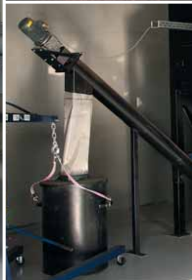
Automatic ash removal